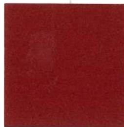
DX631R8014 RAL 3004