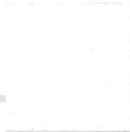
DX632W8018 RAL 9016