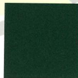
DX631G8034 RAL 6009