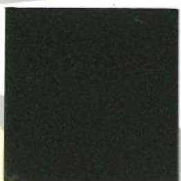
DX631M8013 RAL 8019