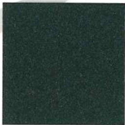
DX631AS8024 RAL 7021