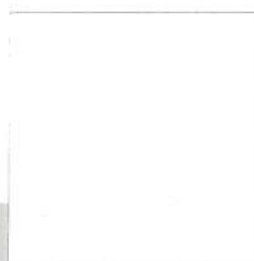
DX632W8016 RAL 9003