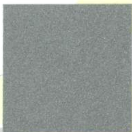
DX632AS8020 RAL 9007