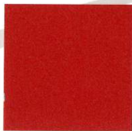
DX632R8015 RAL 3000