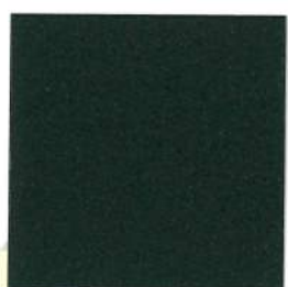
DX631A8050 RAL 7021