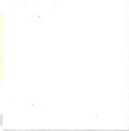
DX632W8017 RAL 9010