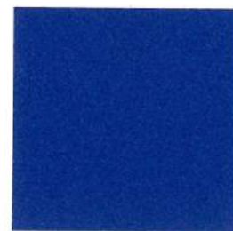
DX632B8026 RAL 5002