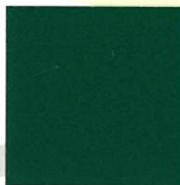
DX631G8033 RAL 6005