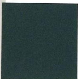
DX631A8049 RAL 7016