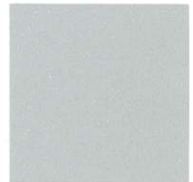
DX632AS8019 RAL 9006