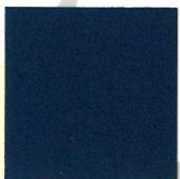
DX631B8024 RAL 5011