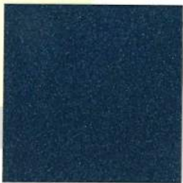
DX631BS8000 RAL 5011

*Please note that all of the products below starting with the letters DX, as well as almost any other RAL color, can also be manufactured in a "sandtex metallic" version. The five swatches below are simply examples of that process. These are all considered custom or made to order powders.