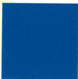
DX632B8025 RAL 5010